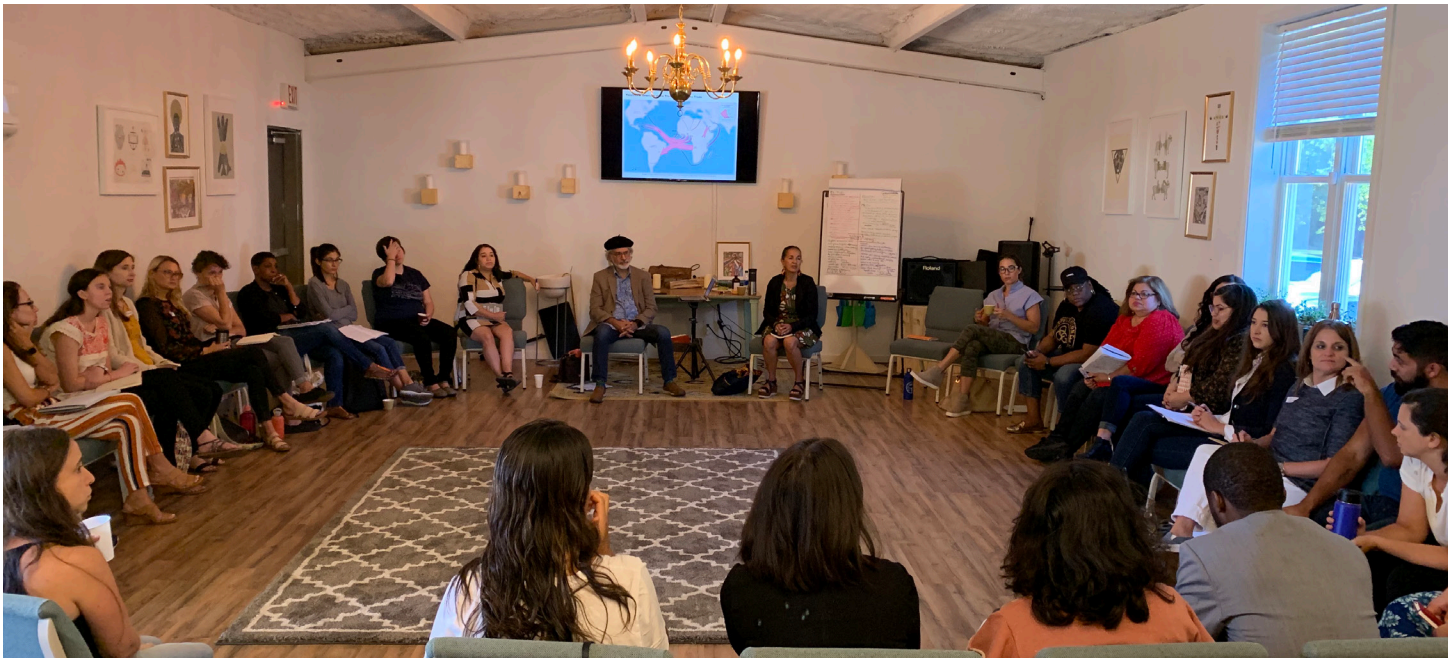
Residents, non-profit employees, foundation officers, and social workers participating in the “Latino Challenges” workshop hosted by the Racial Equity Institute.

You set mood for the next two days with a Café con Leché playlist from Spotify, the garage door wide open allowing the sounds of the park to make an appearance among the conversations of the early arrivers, and the sun to peek through under the awning of the deck. After the chairs were arranged the way the facilitators -- María and Raúl -- requested them to be, after Luís added the final paprika-red dash of Tajín to the avocado toast being served for breakfast, and after the final cups of coffee were poured we sat down in a big circle. As with most events like this the first activity is to go around the circle for introductions to who you are, what you do, why you're there, etc. When everyone had responded María paused to thank Daniela, Sarah, and Felipe for organizing everything and then said something that caught me by surprise and almost brought me to tears. “What a beautiful, intimate setting for our time together. I can feel something special here. What an enchanting space.”